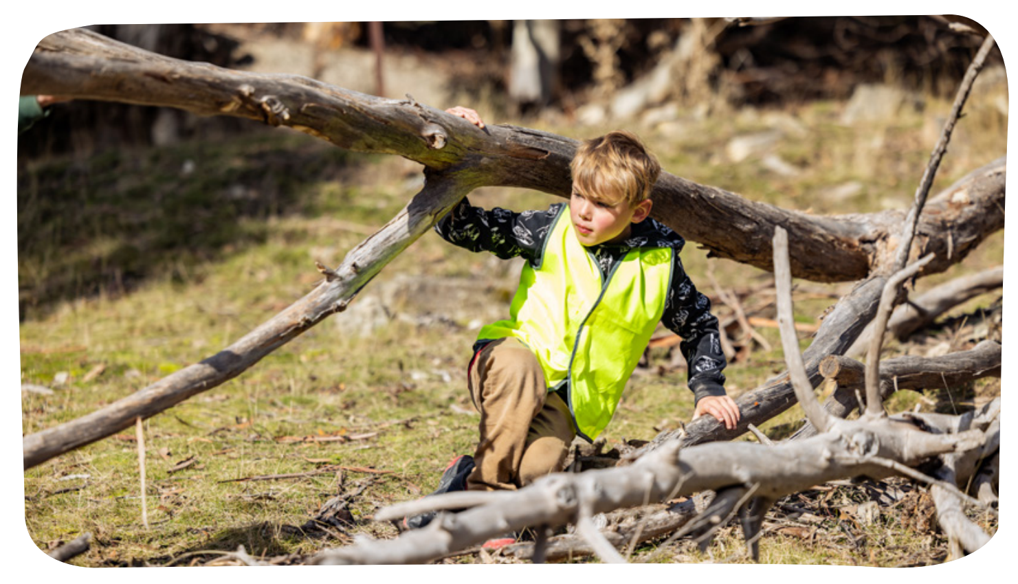
Children participating in risky play.