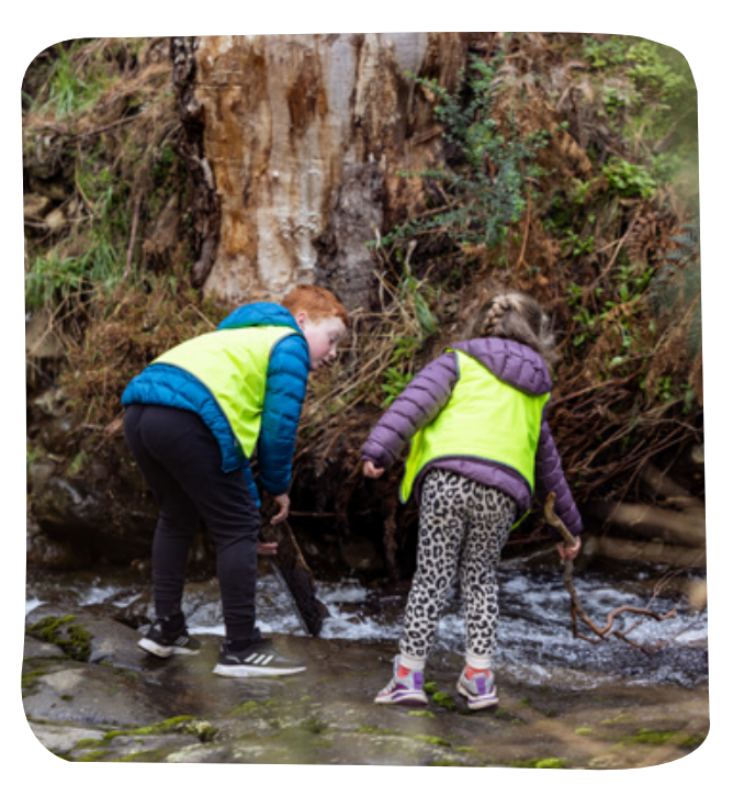
Children fishing with sticks in the creek.

Bush Camp also encourages children to connect with each other and forge strong relationships, something mentally healthy communities rely on. The Be You Learning Resilience domain, Resilience and Social and Emotional Learning Fact Sheets have been key resources for Discovery to implement risky play in this space.