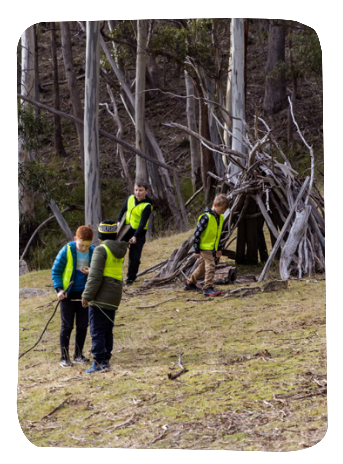
Children use branches to make a hut together.

While the camp provides a unique setting for educators to encourage children to build resilience, like everything, the program is far more than just one thing.